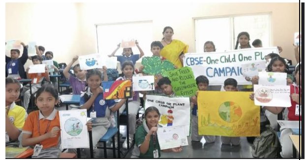
10/08/2023 Class- 2 assembly program on CBSE - One child one plant campaign as Day - 4 programme.