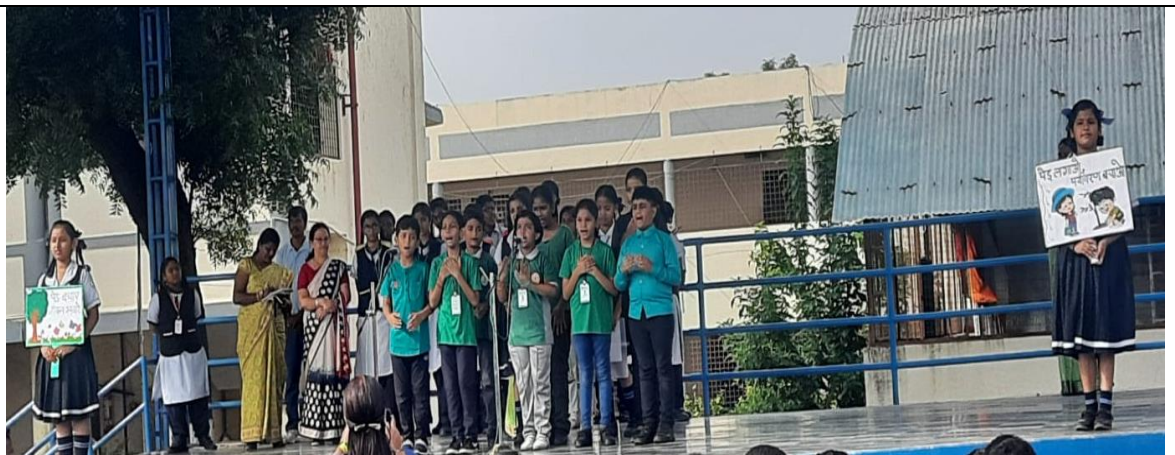
08/08/2023 Class-1 assembly program on CBSE - One child one plant campaign as Day - 2 programme.