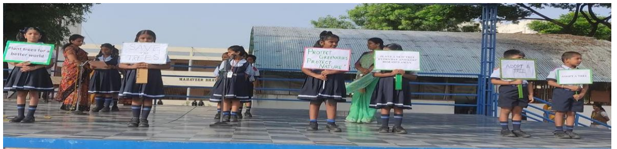
09/08/2023 Class3,4,5 - Hindi assembly program on CBSE - One child one plant campaign as Day -3 programme.