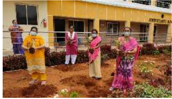
Green School Drive Day