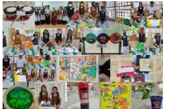
Swachhata School Exhibition Day