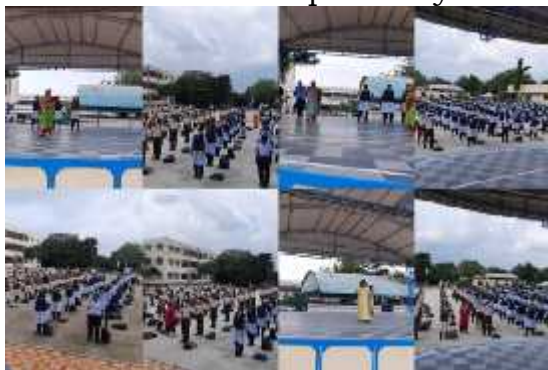
Swachhata Shapath Day