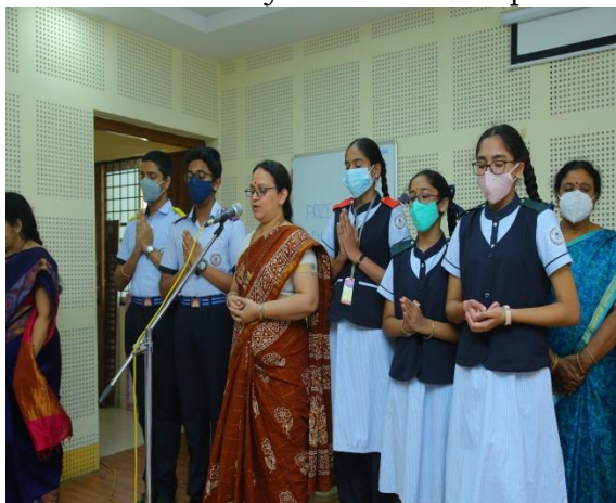
School Prayer- Choir Group