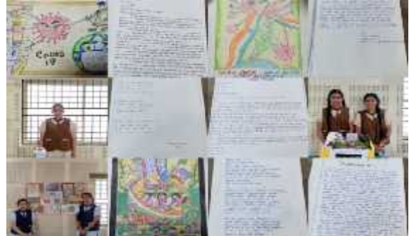
Swachhata Participation Day