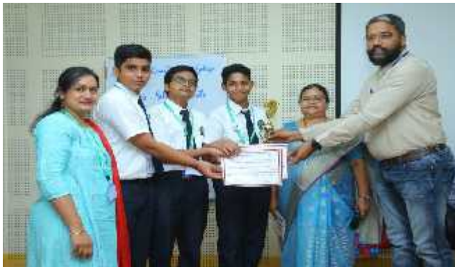
Dyuksha-Best Interjector- APS,RKP