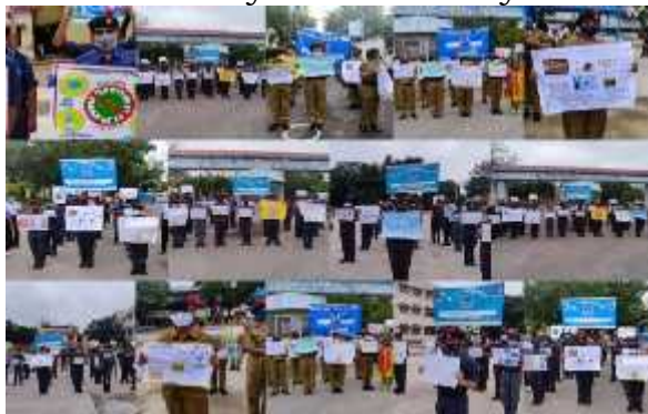
Community Outreach Day