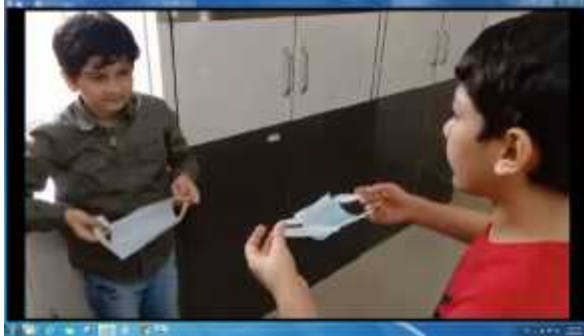
Personal Hygiene Day