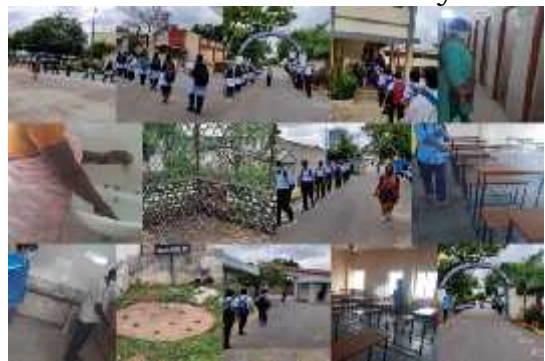
Swachhatha Awarssness Day